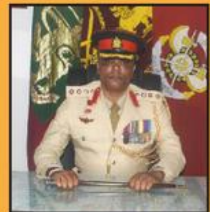
Colonel W M P W N D B Weerakoon RSP USP

assumed office as the Commander, 642 Infantry Brigade