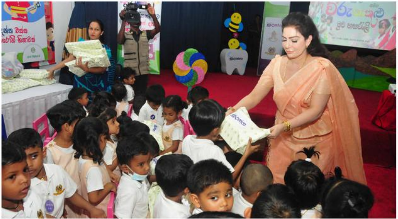
" Mobile dental care for 'Viru Kekulu' pre-school kids