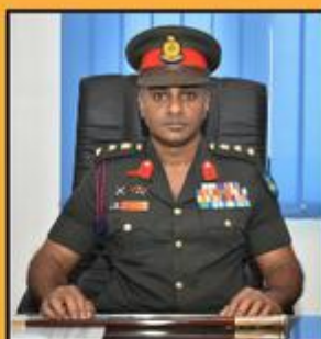
Colonel C D Welagedara USP IG assumed office as the Colonel General Staff, 23 Infantry Division