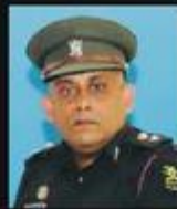
By Lieutenant Duminda Senarath SLAGSC Directorate of Media Army Headquarters

Bronze medal winner at the Commonwealth Games 2022