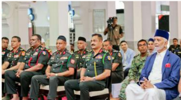
Islam Religious Prayers was held at Jumma Mosque at Colpetty