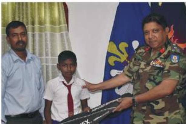
College, Kilinochchi Hindu College and Kilinochchi St Theresa College with the coordination of school authorities.

Commander, 571 Infantry Brigade also distributed incentives to the badminton-loving students at Kilinochchi Maha Vidyalaya, Kilinochchi Central