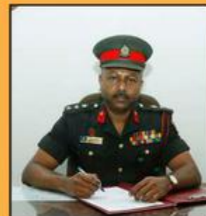
Colonel P K N R Ratnasinghe KSP assumed the duties as Senior Civil Coordinating Officer, Security Forces (West) on 27 September 2022