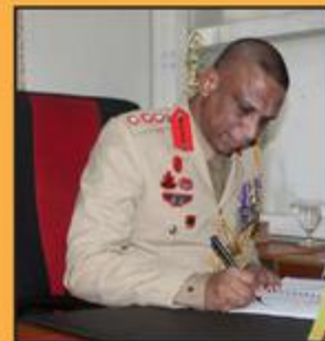
Colonel K M C S Kumarasinghe assumed the duties as Commander, 522 Infantry Brigade on 16 September 2022