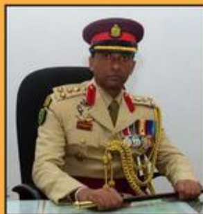
Brigadier T C M G S T Cooray RWP RSP USP psc assumed the duties as Commander, 112 Infantry Brigade on 14 September 2022