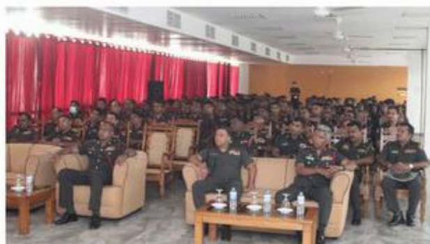
The Lecture conducted at Regimental Centre, Sri Lanka Army Medical Corps