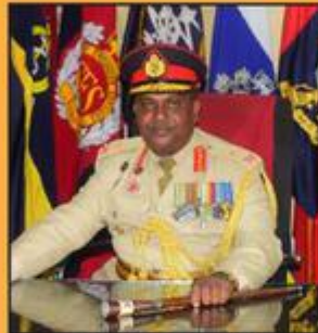
Major General M W T C Mettananda USP ndc assumed the duties as Colonel Commandant, Sri Lanka Army General Service Corps on 01 September 2022 (Also, assumed the duties as Commander, Forward Maintenance Area (East), on 22 September 2022