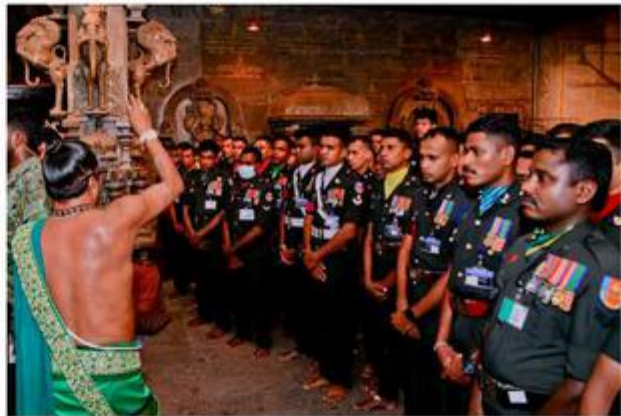
Hindu Arachanam (Mantra Chanting) was held at Mayurapathi Sri Bhadrakali Amman Kovil at Colombo 06