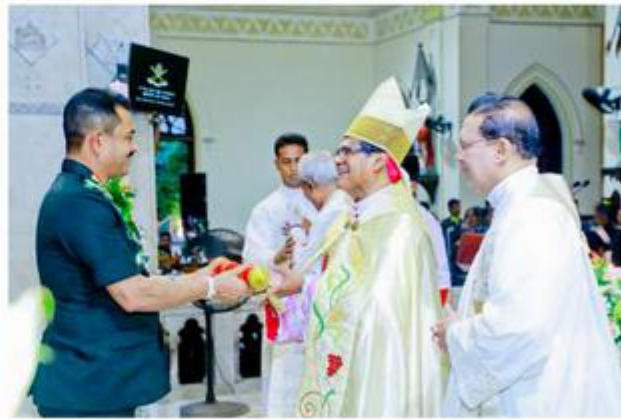
A special Mass was held at All Saints' Church, Borella