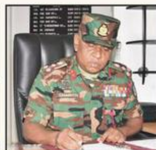
Brigadier C S Dissanayeke ato assumed the duties as the Brigadier (Admin/ Quart) of Security Force Headquarters (Mullaitivu) on 24 January 2022