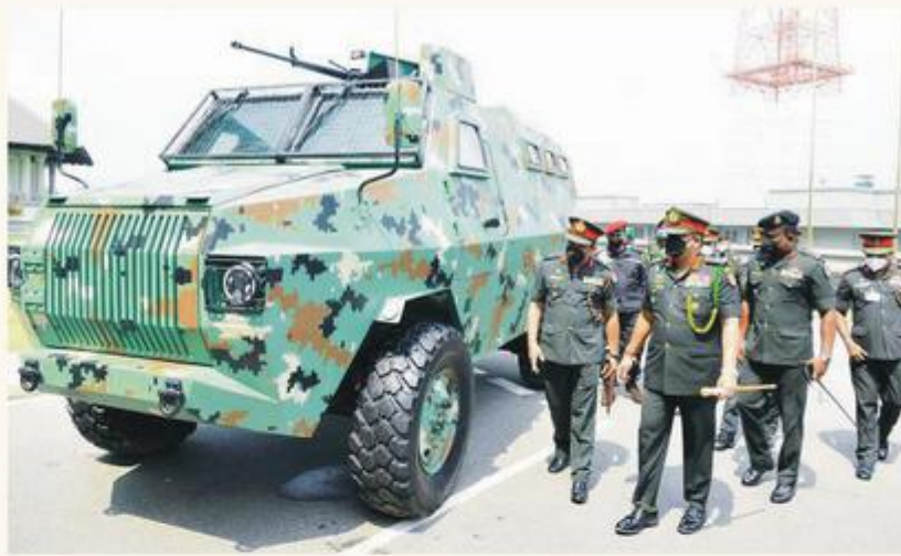
Armoured Corps under the light armoured vehicle category.

The new six cylinder Diesel Unicob-MRAP Vehicle that stands a monumental tribute to creative and manufacturing prowess of SLEME workforce, has been produced by using discarded engines, scrap and chassis which were earlier used by the Army, and the manufacture of this Unicob-MRAP Vehicle would inevitably enhance armoured capabilities of the Sri Lanka