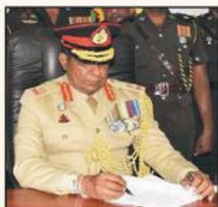
Major General M E P Weerasinghe USP ato assumed the duties as the Commander Forward Maintenance Area (North/East) on 21 January 2022