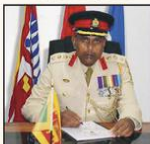
Colonel N D P Gunatunga assumed the duties as the Commander 681 Infantry Brigade on 03 February 2022