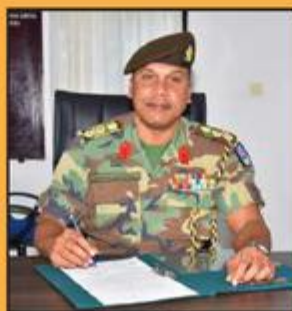
Colonel G T C Madurawala USP assumed the duties as the Colonel (Admin/ Quartering), Security Force Headquarters (Mullaithuvu) on 08 August 2022