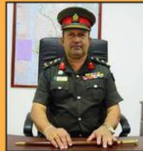
Brigadier S N Kithulgoda USP

assumed the duties as the Brigadier (Admin/ Quartermaster), 1 Corps, Sri Lanka Army