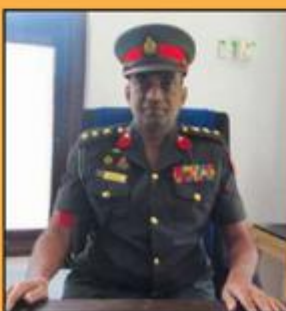
Colonel H P N Parackramawansa RSP USP assumed the duties as the Colonel (Admin/ Quartering), Security Force Headquarters (Central) on 06 August 2022