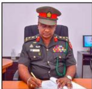
Brigadier W M S C K Wanasinghe RSP USP assumed duties as the Brigadier General Staff, Security Force Headquarters (Central) on 26 April 2022