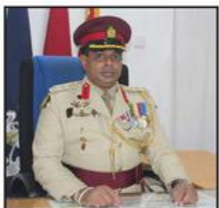
Colonel S P Wickramasekera RWP RSP USP psc assumed duties as the Commander, 532 Infantry Brigade on 20 December 2021