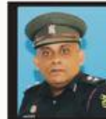
By Lieutenant Diminda Senarath SLAGSC Directorate of Media Army Headquarters

An ENT trained doctor will be able to easily remove impacted fish bones at the back of the throat using his headlight forceps and your cooperation. If the bone is not visible on primary examination, we will then proceed to endoscopic evaluation which can be performed under general or local anaesthesia depending on the site the bone is detected.