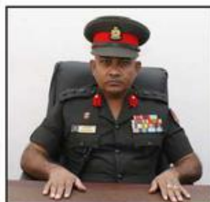
Colonel A R W C Asurasingha RWP RSP USP assumed duties as the Colonel Coordinating, Security Force Headquarters (West) on 12 April 2022