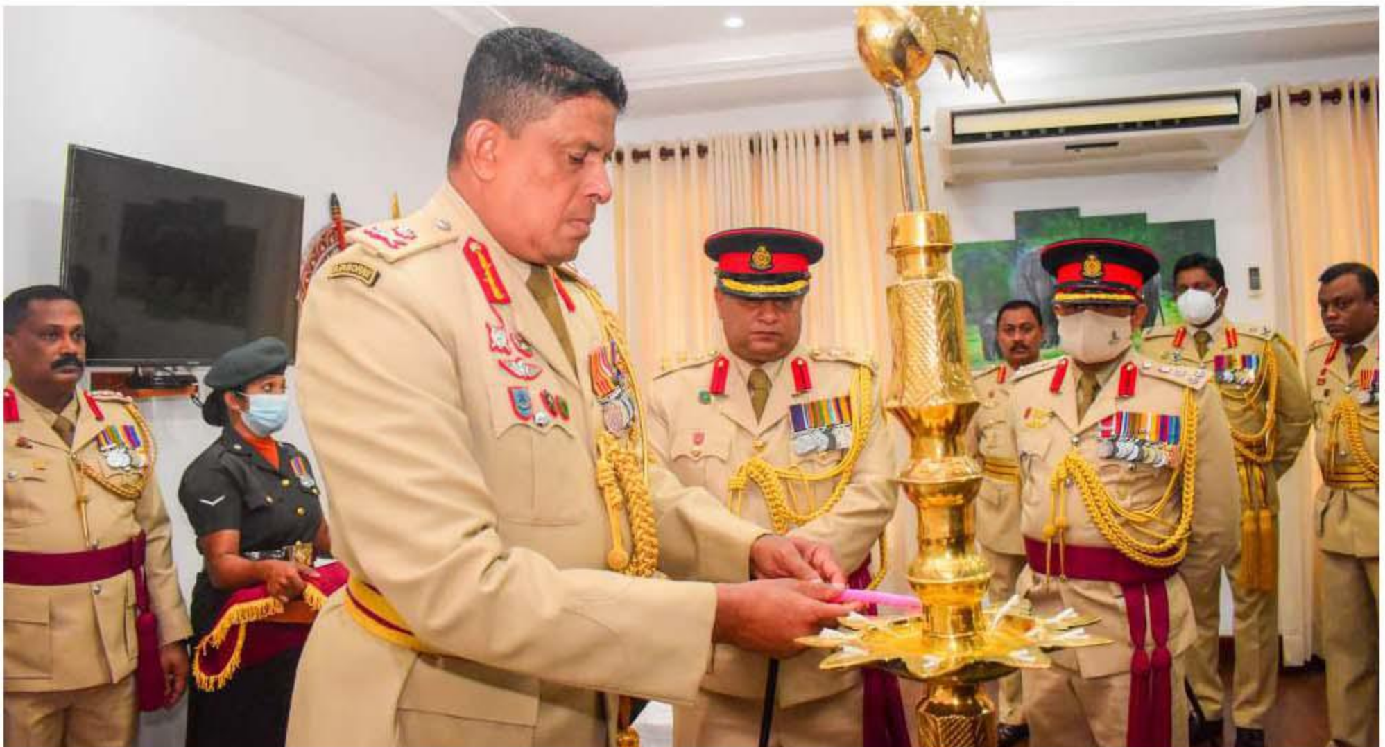
Major General P M L Chandrasiri of the Gemunu Watch assumed office as the 22 nd Commander, Security Forces (East) on 15 December 2021 amidst religious and traditional military formalities at the Security Force Headquarters (East) premises at Welikanda.