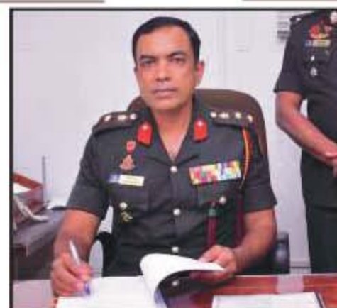
Colonel M J Ubeseekara RSP psc assumed duties as the Colonel General Staff, Security Force Headquarters (Central) on 20 December 2021