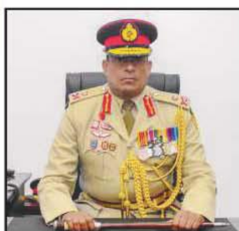
Major General P M L Chandrasiri WWV RWP RSP ndu assumed duties as the Commander, Security Force Headquarters (East) on 15 December 2021 also assumed duties as the Colonel of the Regiment, Gemunu Watch on 08 December 2021