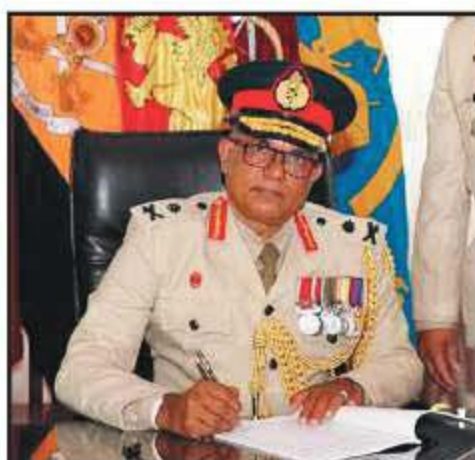
Major General K Liyanage RWP RSP ndu assumed duties as the Commander Security Forces (West) on 16 December 2021