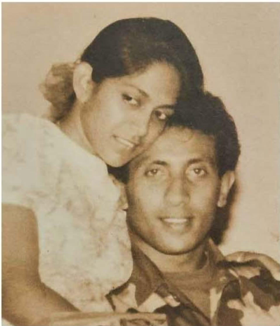
With his beloved spouse

Though he was a moor by birth it did not took much time to win the hearts of Sinhalese and others as he was equipped with divine human qualities. He had rendered a meticulous service to the school earning the membership of School Union of St Anthony to pay the gratefulness. The young man in the bold youth was having an idea to wear a military uniform. Though the parents had persuaded him to go to Libiya to study Engineering, the desire to wear the military uniform was higher than that. His constant request to join the Sri Lanka Army to protect the Nation was finally granted before his continuous beg for the dream.