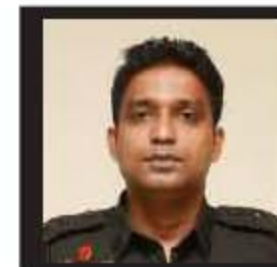
By Captain Nisal Rukshan SLSR Directorate of Media

The pandemic situation is still prevailing in the country fluctuating the affected rate and the death rate. But the efforts and the contribution of the Sri Lanka Army towards the Nation in eradicating the Coronavirus is remaining unchanged. Discipline, training and professionalism of the troops of Sri Lanka Army will make a better future for the nation by proving the complete meaning of the phrase, "Protectors of the Nation".