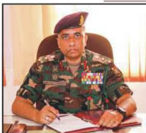
Colonel M B L Perera RSP USP psc assumed duties as the Colonel General Staff of Security Force Headquarters (West) on 14 November 2021