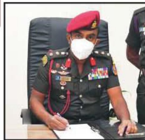
Colonel B M A Balasooriya RSP USP psc assumed duties as the Colonel, General Staff of General Staff Branch on 16 December 2021